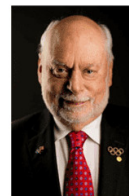
Sir Fraser Stoddart Nobel Prize in Chemistry 2016