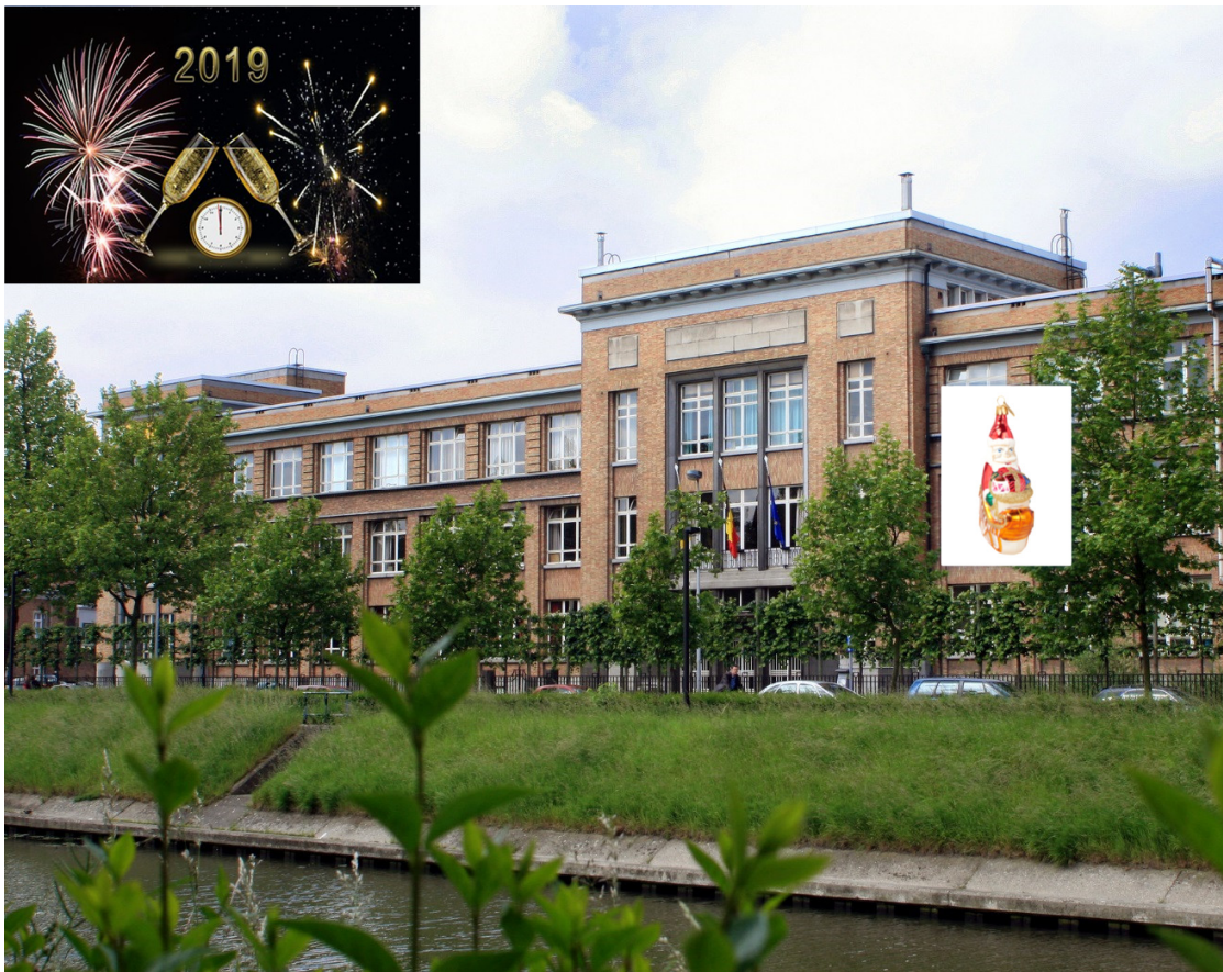
Faculty of Bioscience Engineering – Ghent University Alumni Newsletter - Issue 5 – December 2018